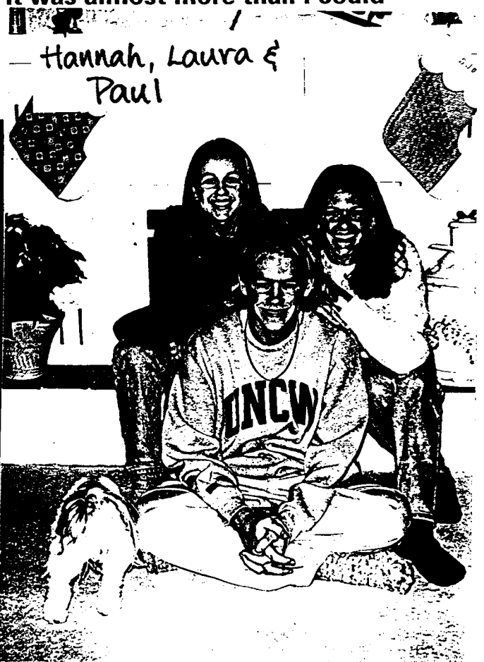
A night at the Refior home...

** End of part one. Will be continued. **