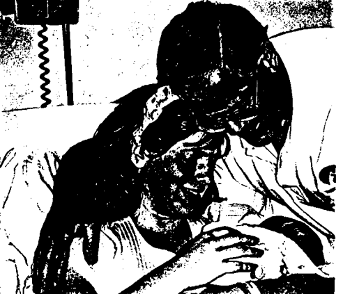
Roses on Easter for Grandma + Aunt