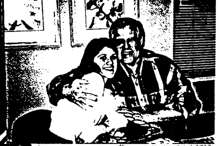
IN THE WAITING ROOM